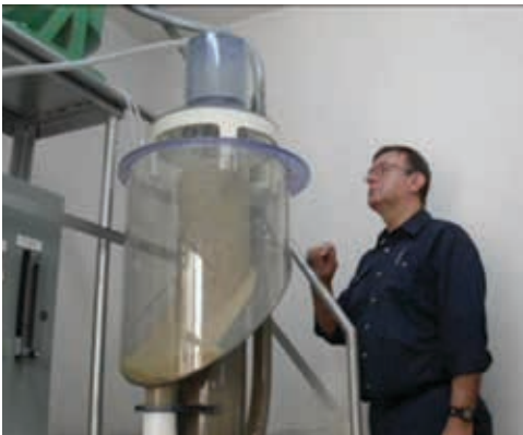
Liquid tracer tests conducted in our labs verify mixing intensity and residence time distribution for the company's CoalPro™ flotation column. Eriez has 20,000 square feet of lab space dedicated to research and development.