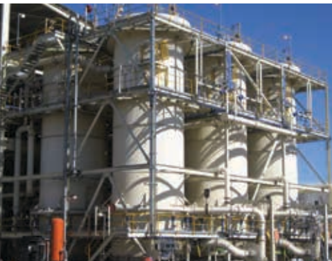
EFD column systems have low maintenance and inventory requirements. Power costs can be 40 to 50 percent lower than equivalent mechanical flotation circuits.

The Eriez Flotation Division (EFD) provides advanced engineering, metallurgical testing and innovative flotation technology for the mining and minerals processing industries. This division is a new operating entity combining the minerals processing expertise of Eriez and its subsidiary, Canadian Process Technologies (CPT). Strengths in process engineering, equipment design and fabrication have enabled the EFD to assume a leadership role in meeting increasing global demands for minerals flotation systems.